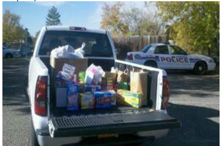
Truck full of donations ready to be delivered to the Rio Grande Chapter of the Blue Star Mothers

"My heroes are those who risk their lives every day to protect our world and make it a better place - police, firefighters and members of our armed forces." - Sidney Sheldon